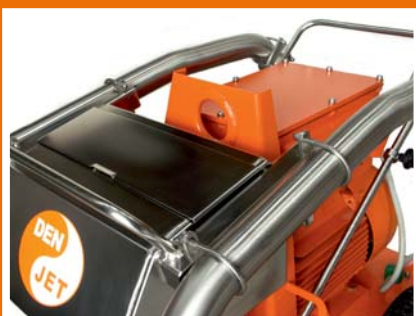
One centralized and balanced lifting eye.