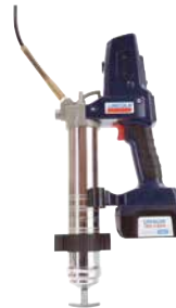
18 V Li-Ion PowerLuber Model 1862-E