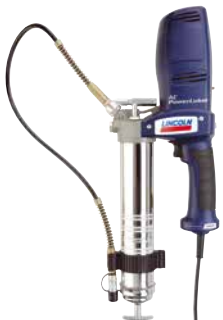
120 V AC PowerLuber Model AC2440