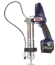
18 V NiCd PowerLuber Model 1842-E