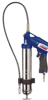
Pneumatic PowerLuber Model 1162