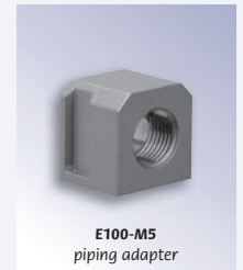
E100-M5 piping adapter