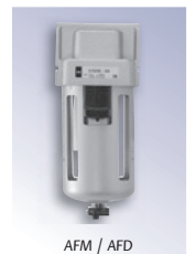
AFM / AFD

Max. supply pressure: 15 bar / Max. working pressure: 10 bar / Temperature working area: -5 to 60° C.