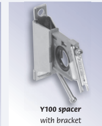
Y100 spacer with bracket